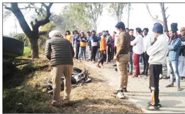
MAINPAL KASHYAP INDRI, FEB 7

INDRI: In the collision between a tractor trolley loaded with sugarcane and a motor cycle on Kurukshetra road, the motorcyclist was buried under the sugarcane trolley, while one died on the spot, two youths were admitted to a private hospital in serious condition. As soon as the information was received, the police reached the spot and started investigation into the matter. According to the information received, three youth were going on duty at Piccadilly Sugar Mill from their village Badshalu on a motorcycle. A tractor trolley full of sugarcane hit the motorcycle riders. The injured were rescued with the help of passers-by in which one died on the spot and two youth are being treated in a private hospital. The condition of two youth is still serious.