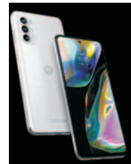
Image Stabilization enables consumers to take more stable pictures and videos and it also enhances the quality of images in low light conditions. The 8MP secondary camera acts as an ultra-wide as well as a depth sensor, while the dedicated Macro vision lens allows consumers to get 4X closer to their subjects. The moto g82 5G is available in two variants with 6GB RAM + 128GB storage and 8GB RAM + 128GB storage.

Chandigarh: Motorola launched the latest addition to its g series franchise, the new moto g82 5G, a groundbreaking new smartphone with the best features in the segment. The moto g82 5G comes with a revolutionary, flagship-grade 10-bit display which supports an incredible billion colours, 64 times more than standard 8-bit displays. Not just that, the g82 5G features a 120Hz pOLED display which is thinner, lighter, more durable and allows for slimmer bezels as compared to traditional AMOLED displays. The moto g82 5G also disrupts the segment, by being the first in its segment to introduce a 50MP OIS camera. Optical