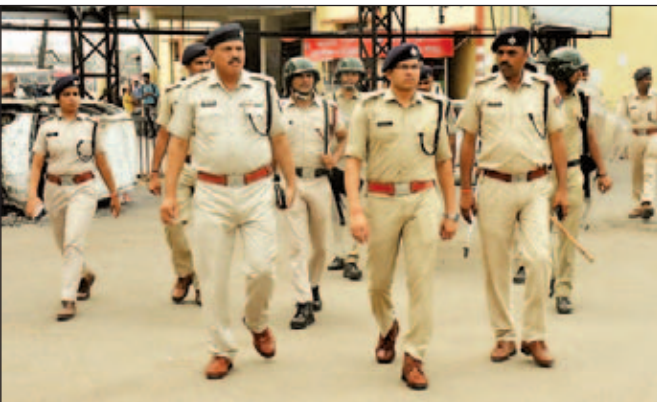
PATNA, JUNE 18

government has spoken to the Union Home Ministry in this regard. He said that nearly 70 freedom fighters, who lost their lives fighting against the Portuguese rule in 1955, their names and history will be displayed on the memorial at Patradevi in north Goa. Sawant urged students to visit the Aguada jail (now converted into a museum), where freedom fighters were kept captive by the Portuguese, to know the history of Goa. "History will be displayed there and will be shown in a picture form.