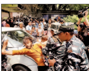
PANAJI, JUNE 18