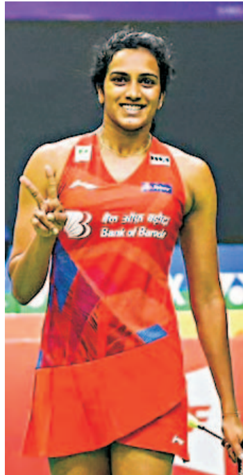
KUALA LUMPUR : Two-time Olympic medalist PV Sindhu

stormed into the quarter-finals of the ongoing Malaysia Masters 2022 on Thursday.