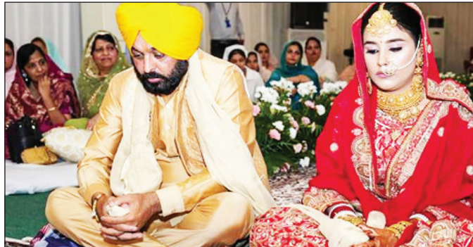
Anand Karaj ceremony.

It was a private ceremony without the usual crowds, so much a part of the big, fat Indian wedding. Though few details were available, visuals on television and Twitter showed Mann and his bride dressed in red at the