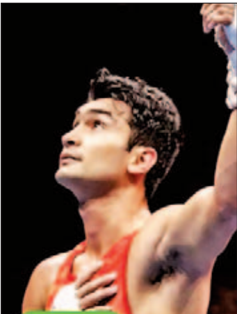
AGENCY BIRMINGHAM, JULY 29

Indian boxer Shiva Thapa defeated Pakistan's Suleman Baloch 5-0 in the first round of the men's 63 Kg weight category here at the Commonwealth Games 2022 in Birmingham on Friday.