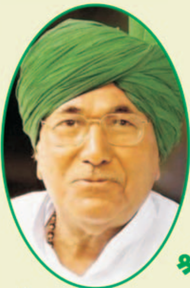
चौ. ओमप्रकाश चौटाला

सभी प्रदेशवासियों को स्वतंत्रता दिवस व श्री कृष्ण जन्माष्टमी की हार्दिक