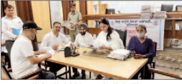
National Lok Adalat organised in Ludhiana.