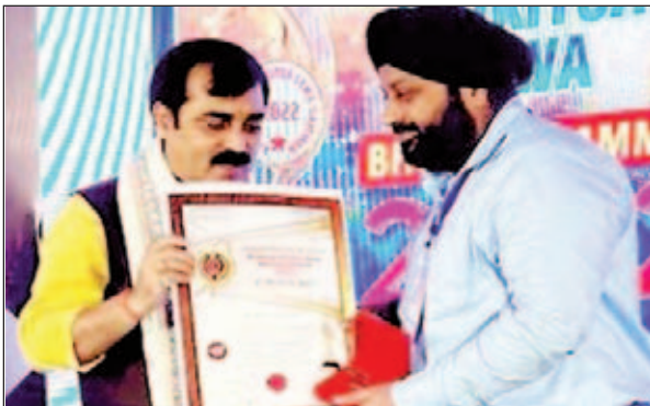
MOHALI, AUG 30