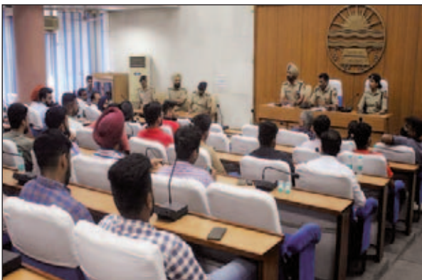
CHANDIGARH, AUG 30