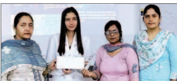
CHANDIGARH, AUG 30