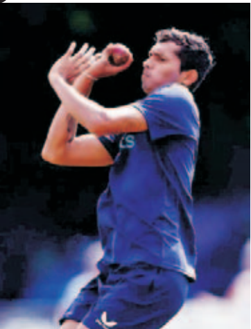
BCCI on Friday announced India A squad against New Zealand A in one-day