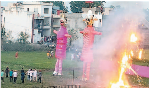
Scene of Dussehra celebrated at Pathankot