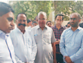
this morning and instead of going to the Market Committee office, he

selling the paddy. He reached Anaj Mandi at 10:40