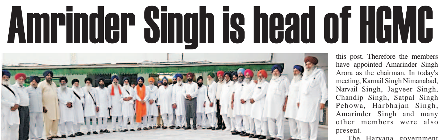
SHIV KUMAR SHARMA KARNAL, OCTOBER 5

HP logs 14 more Covid cases Dharamshala, Oct 5 (UNI) With the number of the fresh Covid 19 cases in the state detected and at least 14 fresh cases tested positive on Wednesday for the lethal novel Cornelius in one day, in Himachal Pradesh pushing the Himachal Pradesh state caseload to 312281. The fresh cases included the highest 5 each from Kullu and Bilaspur district of Himachal Pradesh. Spokesman of the Health Department told UNI that all the 14 fresh cases who have tested positive today have been isolated as per the protocol. The spokesman said that today there was no Covid death reported from any part of this hill state though the death toll remained stagnant at 4189. He said that the number of active cases has further gone up to 115 on Wednesday which included 26 from Kangra, 15 Mandi, 11 from Shimla, 18 from Bilaspur , Kullu 22, Hamirpur 6 and remaining 17 cases are from other six districts of this hill state.