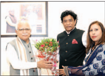
Centre in Mauritius.

He said that this event has created a special awareness about the teachings of the Bhagavad Gita in his country. He also expressed his desire to set up a Gita Kendra on similar lines to the already established Ramayana