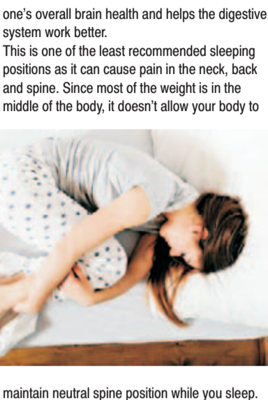
maintain neutral spine position while you sleep.

Sleep plays a major role in the way we look, feel and function. The word 'sleep' has now become synonymous with the word 'immunity', hence a healthy seven- to eight-hour sleep is recommended by experts for your body's immune system to be good.