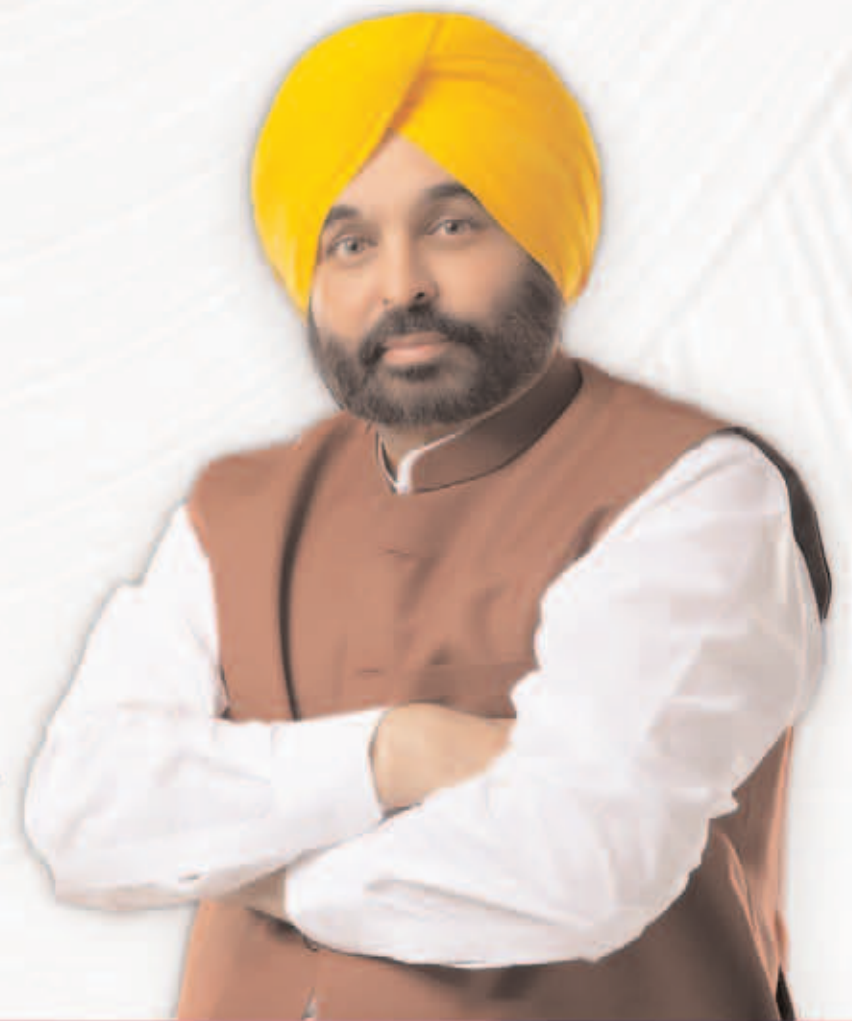
Bhagwant Mann Chief Minister, Punjab