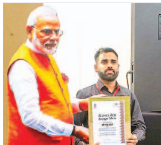
NEW DELHI, OCT 22

various heads, under Haryana Electric Vehicle (EV) Policy 2022. The Chief Minister was apprised that the EV Policy aims to protect the environment, reduce carbon footprint, make Haryana an EV manufacturing hub, ensure skill development in EV field, encourage uptake of EV vehicles, provide EV charging infrastructure and encourage R&D in EV technology. The policy encourages new manufacturing in EV technology and also encourages existing automobile manufacturers to diversify in EV manufacturing domain.