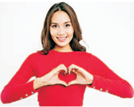
It takes just about a year for one's

several heart related ailments. "A smoker is twice as likely to develop a heart attack compared to a non-smoker, and 3-4 times more likely to die from one, compared to non-smoker.