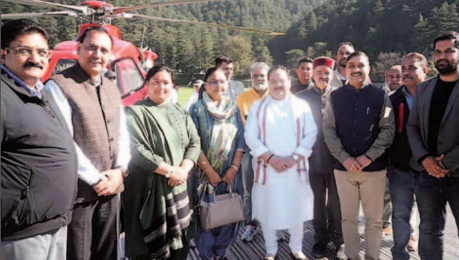
BJP National President Jagat Prakash Nadda was accorded a warm welcome by Chief Minister Jairam Thakur and BJP State President Suresh Kashyap after he arrived in Shimla on Thursday. Nadda attended a party meeting at Peterhof hotel in Shimla late in the evening today.