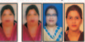
ਬਠਿੰਡਾ ਵਿਕਾਸ ਅਥਾਰਿਟੀ, ਬਠਿੰਡਾ