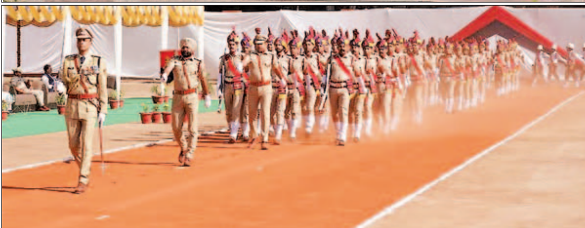
Banwarilal Purohit, Administrator, Chandigarh at the 56th Raising Day of Chandigarh Police.