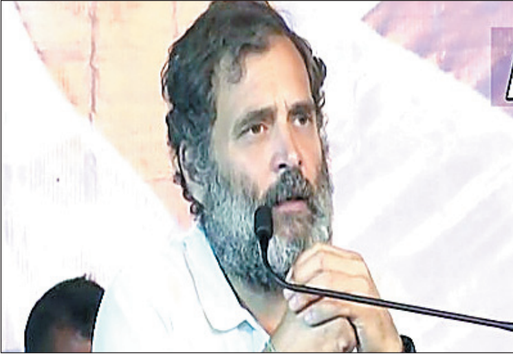
Addressing a public rally in the state, Baghel said, "The BJP government only brought inflation and job-

Ahead of Himachal Pradesh assembly polls, Congress leader Rahul Gandhi has said that if Congress forms a government in the state, the Old Pension Scheme will be restored like it has been done in party-ruled Chhattisgarh and Rajasthan and in Jharkhand, where Congress is part of the coalition government. "The old pension (scheme) is security, a promise, not a deal like a new pension. Congress will restore old faith to the senior citizens of Himachal Pradesh. OPS was restored in Chhattisgarh, Rajasthan and Jharkhand. Now it's Himachal's turn," Rahul Gandhi said in a tweet. Earlier on Thursday, Chhattisgarh Chief Minister Bhupesh Baghel said the Congress would restore the Old Pension Scheme (OPS) in Himachal Pradesh in 10 days and provide jobs to 1 lakh people if voted to power in the ensuing Assembly elections.