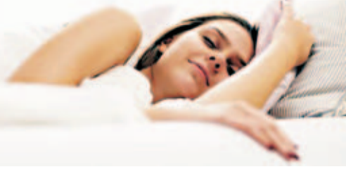
Sleeping In Fetal Position The fetal position is when your body is curled up on the

side and creates a natural curve of the spine. This position is great for lower back pain and pregnancy. It is however advised to not curl up your body too tightly as it can put strain on the joints, constrict breathing and hamper blood flow which can lead to severe health issues in the future.