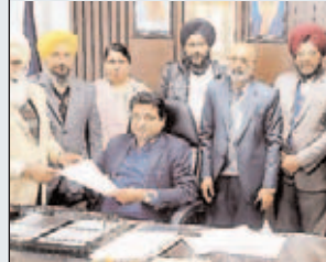
Jan Hit Vikas Committee meets DC Mohali regarding Kharar problem