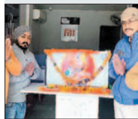
Balakulam Shikshan Sansthan pays respect to Guru Gobind Singh ji

CIRCULATED IN DELHI, CHANDIGARH, PUNJAB, HARYANA, HIMACHAL AND J&amp;K