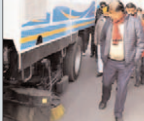
Hoshiarpur to get a state of art vacuum cleaning machine on new year: Jimpa