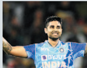
ICC nominates Suryakumar Yadav for Men's T20I Cricketer of Year award