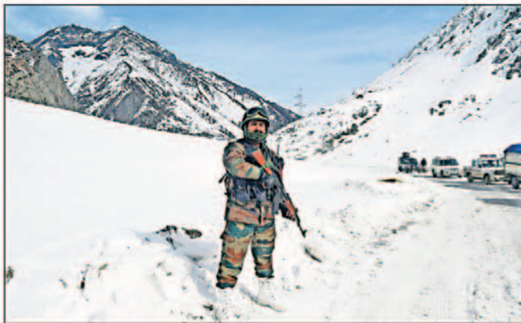
An Indian Army jawan stands guard on the snow-covered Srinagar-Leh Highway at Zojila Pass on Friday.

"A case has been registered after her parents filed the complaint. The girl died early Saturday morning," police told PTI.