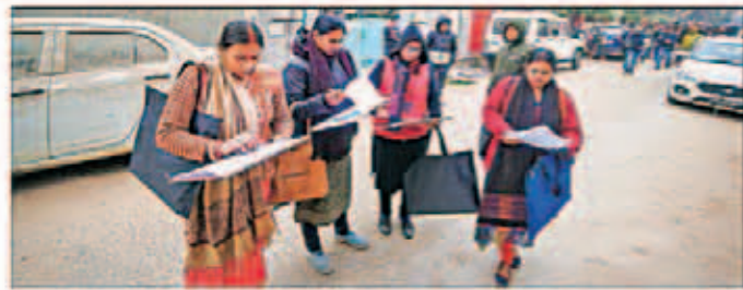
Enumerator staff prepare to record data during the first phase of much-hyped caste-based census in Bihar, in Patna on Saturday.

The decision of a caste census was taken by the Bihar cabinet on June 2 last year, months