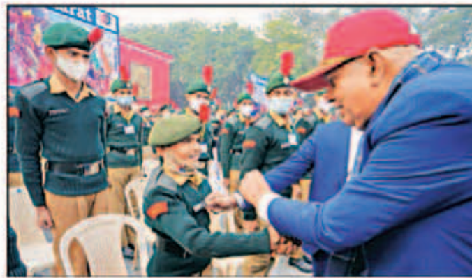
Vice President Jagdeep Dhankhar visits the NCC Republic Day 2023 camp at Delhi Cantt, in New Delhi on Saturday.

"We are in the 'Amritkal' of our Independence. Our Bharat is on the rise as never before. It is now the fifth largest global economy. Only a few months we overtook the UK. By the turn