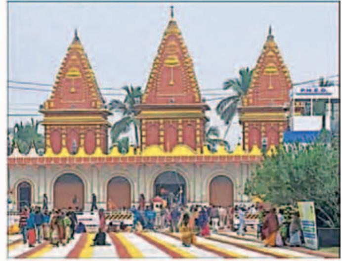
Kapil Muni temple in Sagar Island in West Bengal, the main centre of attraction of Ganga Sagar Mela.