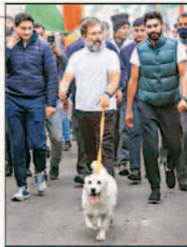
Congress General Secretary Priyanka Gandhi Vadra's dog Luna walks with Rahul Gandhi during the 'Bharat Jodo Yatra' in Karnal on Saturday morning. Boxer Vijender Singh is also seen.