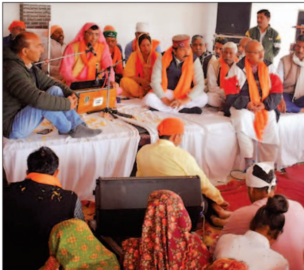
The honourable Deputy Chief Minister Mukesh Agnihotri participated in the programme organised on the occasion of the birth anniversary of Shri Guru Ravidas Ji at Ispur, Haroli, today and bowed his head.

informed that 10 e-vehicle charging stations are to be set up in Dharamshala. 9 E-Vehicle Charging Stations have been set up. With this, e-vehicle owners will also start getting this facility soon. Only one site has been reserved. Dharamshala Smart City Limited Company will provide 15 electric buses in collaboration with HRTC as a pilot project. There will be 15 to 25 seats in the electric bus, in which the disabled can sit and travel in the bus with a wheel chair. E-buses will be more comfortable due to air suspension infrastructure and air conditioning. These buses will charge in less time. They have been manufactured under Electric Bus FAME-2 (Faster Adoption and Manufacturing of Electric Vehicles).