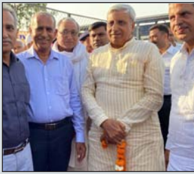
Animal farmers should adopt Brazilian technology in milk production