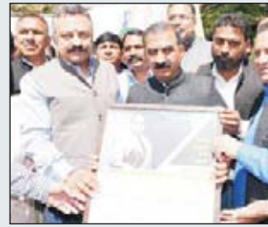
CM Sukhu pays floral tribute on birth anniversary of Dr. Bhimrao Ambedkar