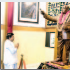
Dr. Ambedkar Jayanti celebrated in Haryana Legislative Assembly