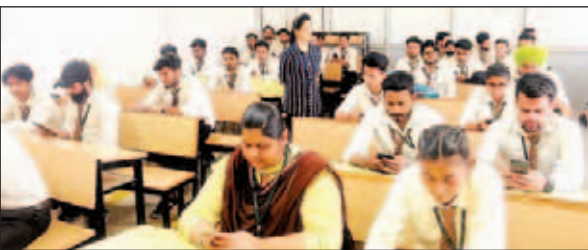
NIRMAL RADAUR, APR 17