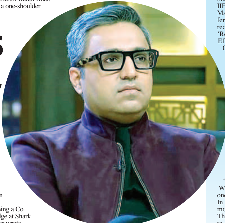
Apart from him, Prince Narula, Rhea Chakraborty and Gautam Gulati will be also seen in the show as the gang leaders.

high-slit pink gown for the premiere. For the glam, she kept her hair tied in a sleek bun and opted for diamond earrings and embellished heels. Whereas, Anurag donned a black jodhpuri suit and Rahul opted for a black tuxedo. The film premiered during the midnight screening at the Cannes 2023. Reportedly, the film received a 7-minute-long standing ovation. The film revolves around an insomniac ex-cop, long thought to be dead, but still operating for the corrupt system, and looking for redemption. ‘Kennedy’ is amongst the only two films from India this year to be the official selections at the festival this year.