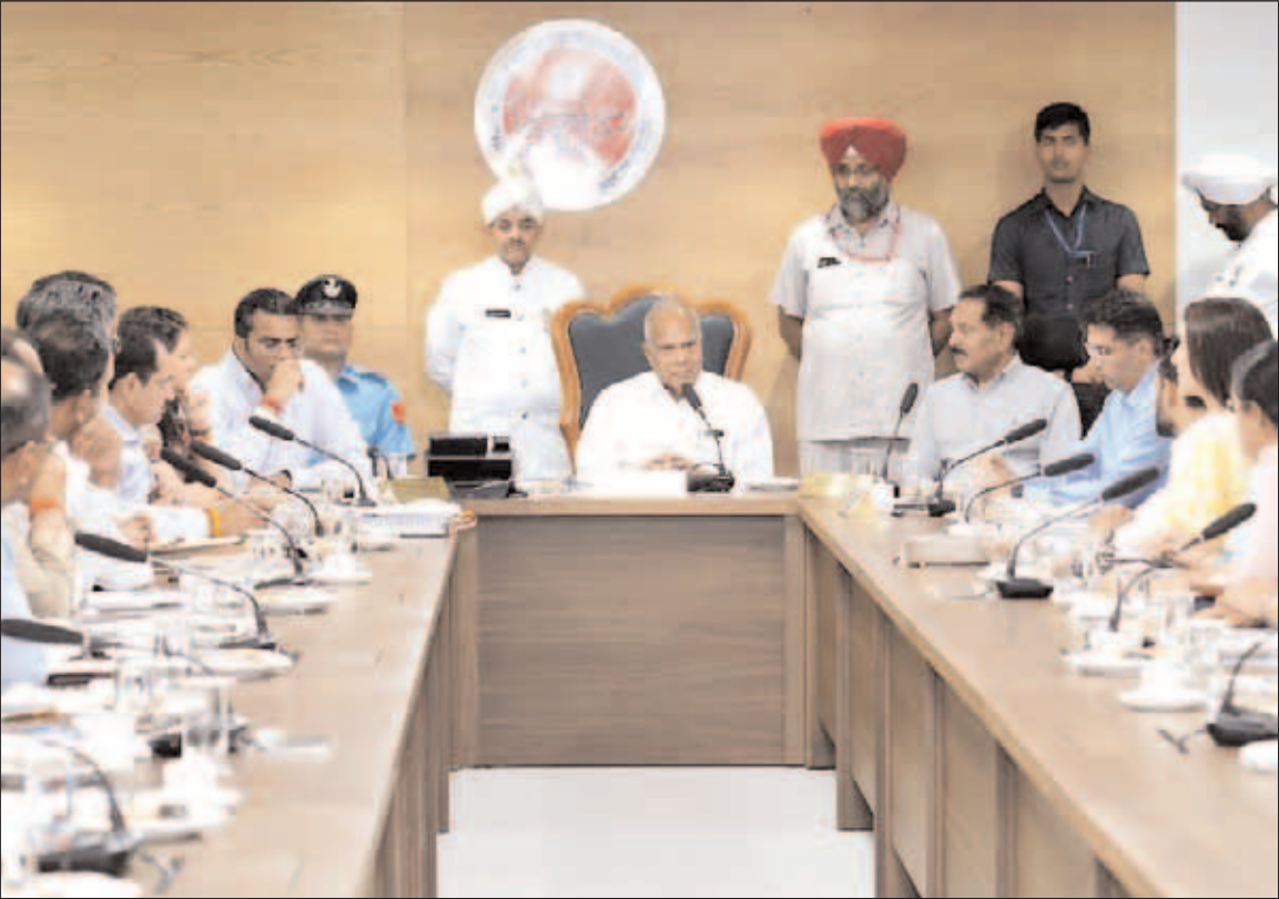
Banwarilal Purohit, Administrator, UT Chandigarh meeting Municipal Corporation Councilors at UT Secretariat.

described as, "unjust, autocratic and inhuman behaviour" of AAP government, for "precipitating an avoidable crisis," by refusing to listen to genuine grievance of farmers, to compel them to retort to extreme step of fast unto death, "just to make themselves heard", that too, by an elected government. Dr Randhawa, in public appeal, urged the people to hoist "Black Flags" on vehicles, houses, shops, public and private buildings to express solidarity with protesting farmers and wreslers.