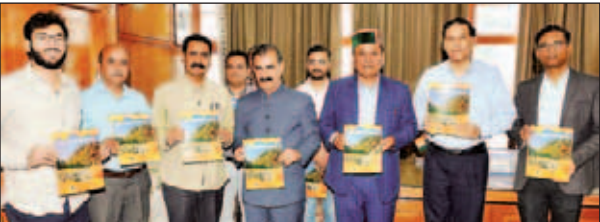
SHIMLA, JULY 31