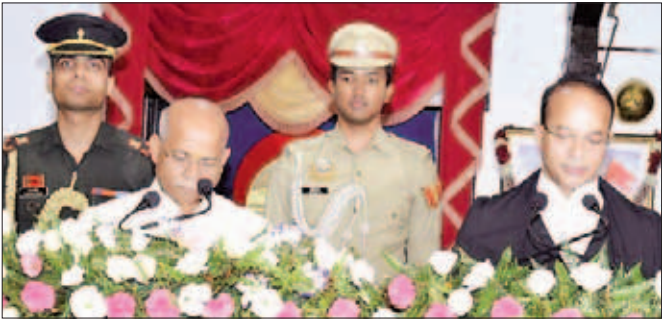
AGENCY SHIMLA, JULY 31

YUGMARG, CHANDIGARH, TUESDAY, AUGUST 1, 2023