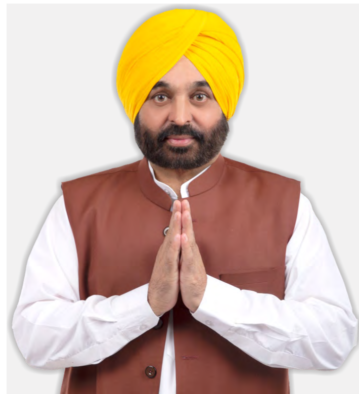
Bhagwant Singh Mann

The legendary king of Agroha, who stood firmly by the ideals of non-violence, peace and compassion for the welfare of mankind