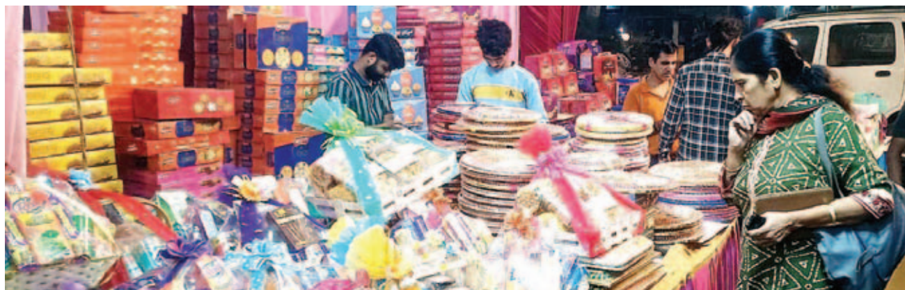
JAGADHRI, NOV 11