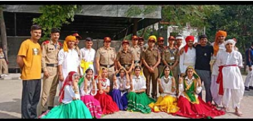
JAGADHRI, NOVEMBER 11