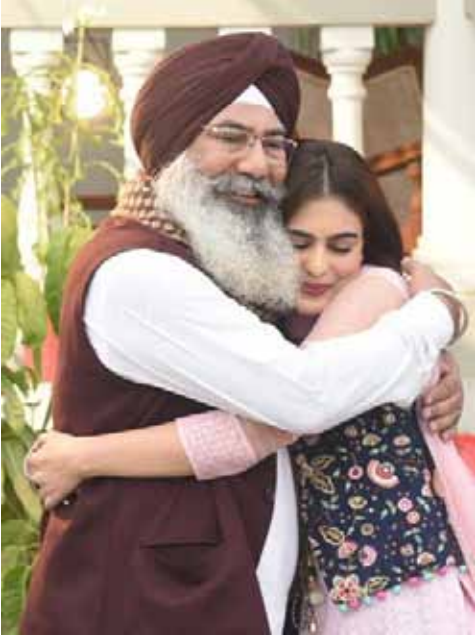
one else come into Heer’s life?