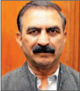
Sukhvinder Singh Sukhu Chief Minister of Himachal Pradesh

oneering state with initiatives like the Mukhya Mantri Sukh Aashray Scheme, introducing a legal framework for orphans. In a remarkable gesture, 4,000 orphans have been granted the status of "Children of the State" under this scheme. This goes beyond festive grants, extending to bearing the expenses of education and providing pocket money exemplify the love and parental care for the orphans. In a resolute commitment to youth empowerment, the government launched the Rs. 680 crore Rajiv Gandhi Swarojgar Start-up Yojana, fostering entrepreneurship.