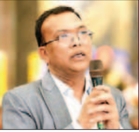
LUDHIANA, MAR 3

Lauding the Punjab government for its myriad of steps towards the development of Punjab and its people every day, the local residents said that Chief Minister Bhagwant Singh Mann's government has ignited a new hope among Punjabis for a better future.