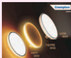
lights at the click of a button, this innovative range caters to diverse moods and occasions.

Chandigarh: Crompton Greaves Consumer Electricals Limited, renowned for its commitment to quality and pioneering innovations in lighting, has been redefining your living spaces with sophistication and unparalleled style. Crompton has launched its all-new premium range, the Trio Range of Lights. A first in industry, the Trio Range offers three distinct lighting experiences from a single product.