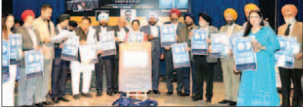
CHANDIGARH, MAR 11