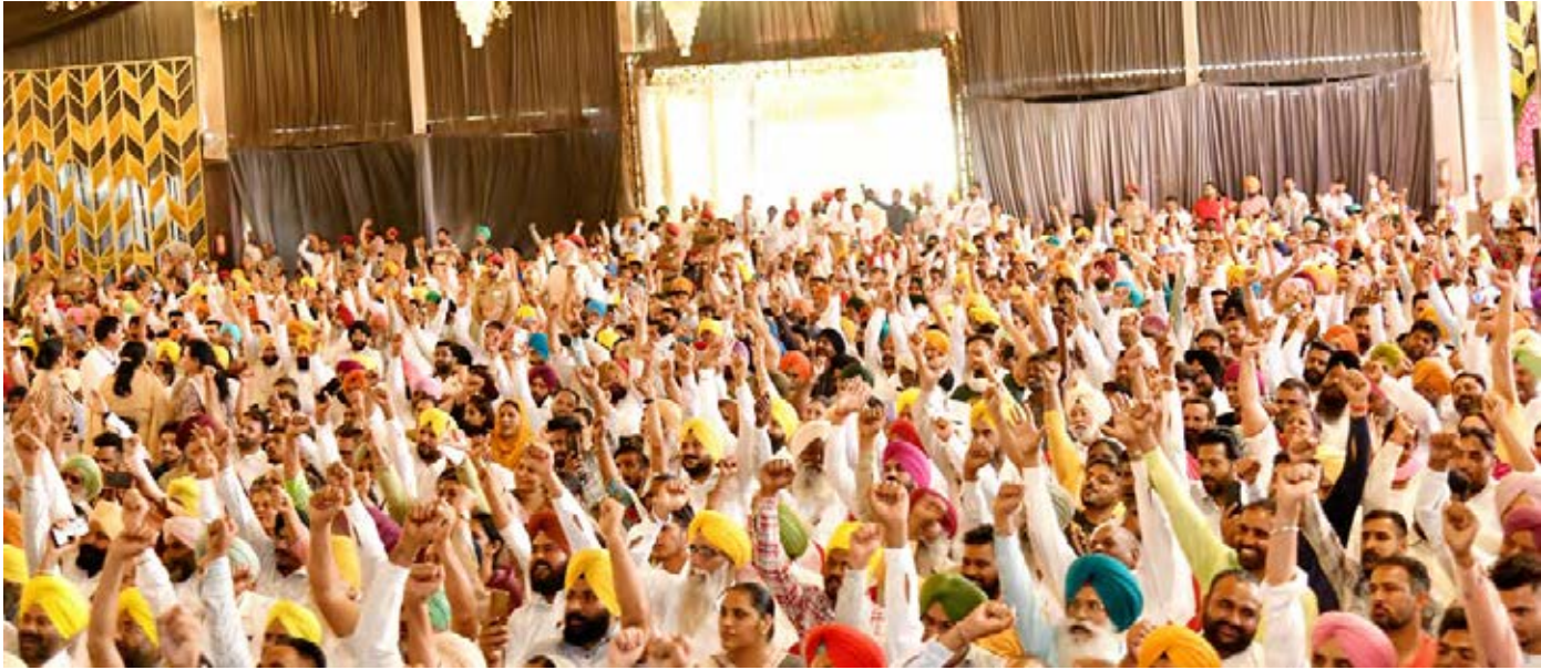
GAURAV GOEL CHANDIGARH, APRIL 6

Chief Minister Bhagwant Mann, blowing the election campaign bugle loudly, reached Moga and Jalandhar, on Saturday, to meet Aam Aadmi Party (AAP) workers and volunteers and asked them to get ready for winning all 13 seats in Punjab in upcoming LS polls.