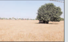
MEGHRAJ LUTHRA KACHCHWA: The golden hue of wheat fields signifies that the wheat crop is ready for harvest in Kachchwa. The harvesting is expected to commence in the next three to four days. If the weather remains favorable, a good yield is anticipated. However, this year, the crop is delayed by ten days compared to the previous year when harvesting began on April 1st. The harvesting of wheat is expected to reach its peak around April 13th, coinciding with the festival of Baisakhi.