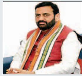
CM Nayab Saini calls ministers and MLAs for dinner