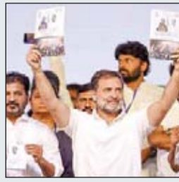
Rahul Gandhi asks for comments, views from people on Congress manifesto