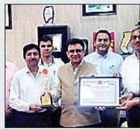
Maharana Pratap University awarded with Best Horticulture University Award