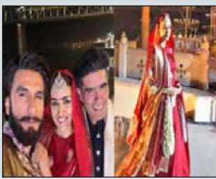
Kriti Sanon turns heads as she walks the ramp at Varanasi ghat