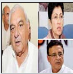
Hooda and Selja-Surjewala face to face on Lok Sabha tickets in Haryana