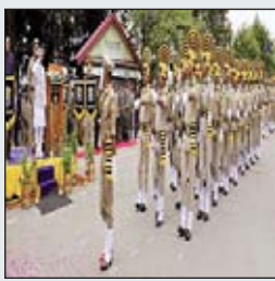
Himachal Day celebrated with fervour