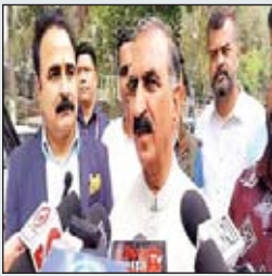
CM Sukhu assures strict action in Palampur incident