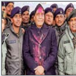
Rajnath hails Siachen as capital of valour and courage