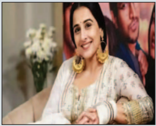
“My heart is full of love, gratitude,” Vidya Balan on audience’s response to ‘Do Aur Do Pyaar’