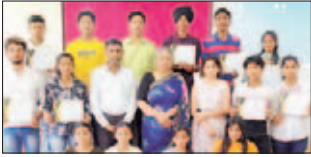
JAGADHRI: The final day of the seven-day web development workshop at Maharaja Agrasen College, Jagadhri, concluded with the utilization of Bootstrap 5. The main focus of this special day was to delve into various web development projects and