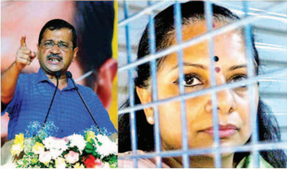
care of the health of the applicant, to ensure that all requisite medical treatment is provided to him in jail; however, in the event of any requirement for specialized

The court said though it shall continue to be the primary duty of Tihar jail authorities, who are stated to be fully equipped to take