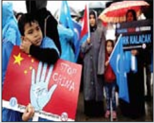
US report exposes arbitrary detention of Uyghurs