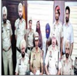
Blind murder case solved, two accused arrested