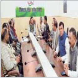
Congress holds meeting to discuss by-elections in state