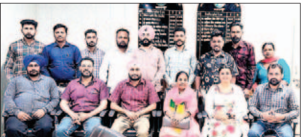
SUKH NAHAR JAGRAON, MAY 1

Students is based on two metrics viz., academic quality, comprising 75% of the weight, and cost of education for the remaining 25%. Based on inclusivity, diversity, and satisfactory student welfare, the GNDU is positioned among the top 27% universities globally in the World University Rankings 2024, as per the Agency. It is the only multi-specialty State University of Northern Region (Jammu, Kashmir, Punjab, Haryana, Rajasthan and Himachal Pradesh) to attain these remarkable accomplishments.