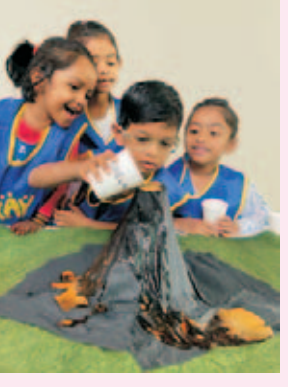
the stepping stone to a child's learning journey. Rated as India's largest chain of preschools and daycare centres, Ms.

NEW DELHI : In the rapidly evolving landscape of education, early learning at preschool plays a crucial role in shaping a child's foundational years. As parents navigate through the range of available options, they look around with a certain set of expectations. Amidst this exploration, discover how KLAY Preschool stands out as the natural choice, seamlessly meeting parental expectations with its innovative approach. The preschool offerings today include much more than literacy and numeracy. There are a range of ideologies, pedagogies, and methodologies that each of them translates into their curriculum. On the other hand, we as parents, are also better informed today and look beyond the childcare facilities. Parents seek immersive preschool environments that serve as nurturing hubs, fostering comprehensive development that lays