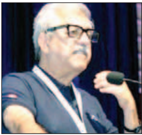
CHANDIGARH, MAY 10