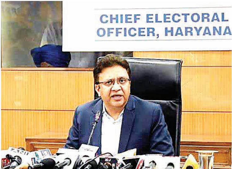
CHIEF ELECTORAL OFFICER, HARYANA

He clarified that the Lok Sabha elections in the state were conducted in a fair and transparent manner. He mentioned that it is a record that this time there was no need for re-polling