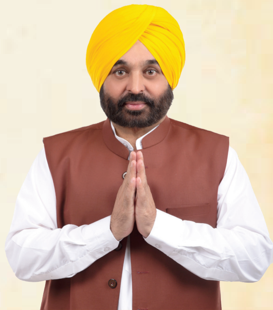
Bhagwant Singh Mann Chief Minister, Punjab

Guru Ji's great contribution in compiling Sri Guru Granth Sahib Ji and construction of Sri Harmandir Sahib at Amritsar shall be remembered till eternity