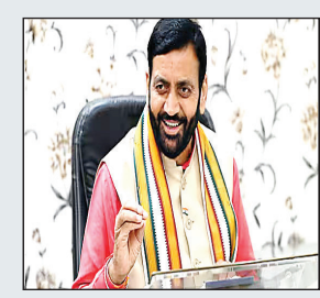
CM nods 5 projects worth Rs. 340 cr for strengthening sewerage network