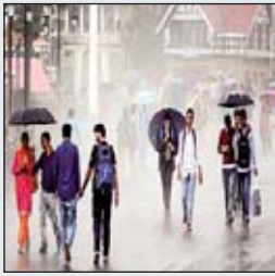
Rain partly disrupts normal life in State