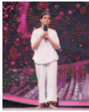
– Jab Dil Kare Dance Kar, which beautifully captures the power of dance and the emotions it evokes. Starting 13th July, every Saturday & Sunday at 8:00 PM, amazing dancers from across the nation will showcase

Chandigarh : Sony Entertainment Television's homegrown dance reality show, India's Best Dancer, returns for its exciting fourth season with a new credo