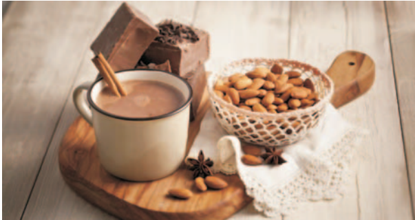
incredibly versatile, as they can be enjoyed in various forms, making

Maintaining good skin health requires more than just external care; it involves nurturing from within. What we consume directly impacts our skin and overall health. Therefore, it is crucial to maintain a clean and balanced diet by incorporating nutritious foods like almonds. Rich in 15 essential nutrients, almonds can work wonders for our skin, improving texture and tone over time. Simply incorporating a handful of almonds into our daily routine can yield significant benefits, visibly enhancing how our skin looks and feels. This World Skin Health Day, observed annually on July 8th, lets look beyond external skincare and focus on nurturing skin health from within. Including almonds in your diet can significantly contribute to reducing skin wrinkles. Rich in healthy fats and vitamin E (alpha-tocopherol), almonds are known for their anti-aging properties that benefit skin health. Regular consumption of almonds may also enhance the skin's resilience against UVB light, the primary source of skin damage from sun exposure, while simultaneously improving skin texture and tone. Additionally, almonds have been recognized for their skin benefits in various traditional medicine texts, including Ayurveda, Siddha, and Unani, due to their ability to enhance skin glow and vitality. These powerhouse nuts are also