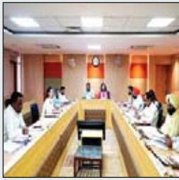
F&CC approves implementation of microchipping in stray dogs to conduct dog census