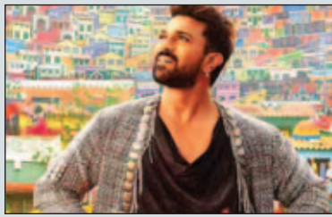
'See you at the cinemas': Ram Charan wraps 'Game Changer' shoot