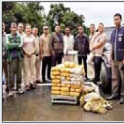
Mizoram Police seizes drugs worth Rs 32.54 cr; two people arrested