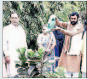
CM plants sapling under the 'Ek Ped Maa Ke Naam' campaign