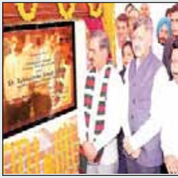
CM lays foundation stone of tourism complex at Auhar in Bilaspur