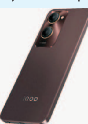
Commenting on the launch,

Priced at INR 10,499 (Effective Price - INR 9,999) for 4GB+ 128GB, INR 11,499 (Effective Price - INR 10,999) for 6GB+128GB with an additional up to 6GB of extended RAM) along with support for up to 1TB of expandable storage. iQOO Z9 Lite will be available on the iQOO e-store and Amazon.in in two youthful and refreshing colour variants : Aqua Flow and Mocha Brown.