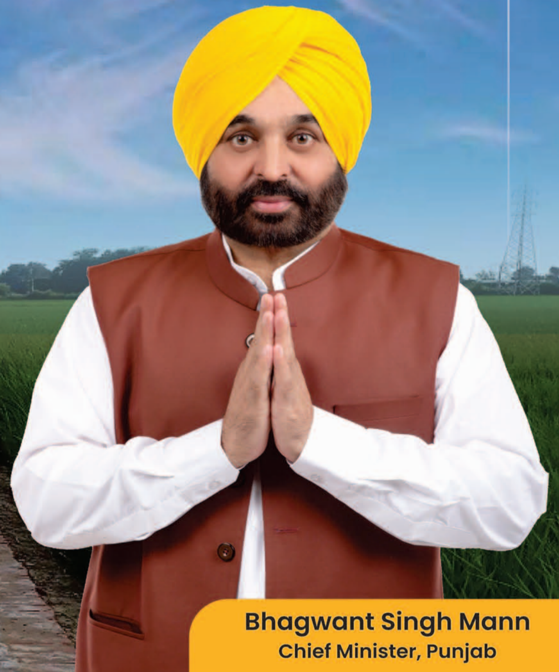
Bhagwant Singh Mann Chief Minister, Punjab