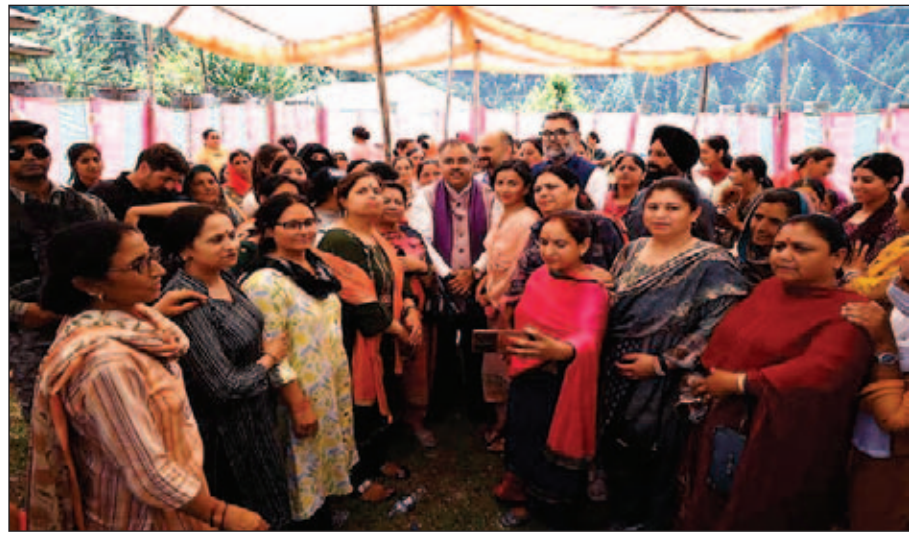
CHANDIGARH, JULY 24

BJP national general secretary Tarun Chugh today said that the Union budget presented in the Lok Sabha would give a new direction and impetus to development in J&K.