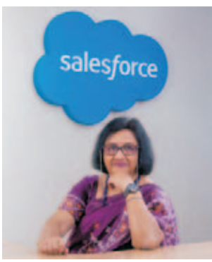
accounting system to access the same and drive true financial inclusion. It is also encouraging to

C handigarh: "The Budget 2024-25 presented was a balanced one, with a distinct focus on women, youth and job creation, emphasising the sustained efforts to generate ample opportunities for all. As the honourable Finance Minister mentioned, India's economic growth continues to be shining exception despite global uncertainties and will remain so in years ahead. Initiatives towards skilling, boosting the participation of women in the workforce, driving the use of technology in agriculture and supporting SMEs that are the greatest employment generators are particularly notable. These measures provide the much-needed fuel to drive India's economic growth. The provision of Rs 1.48 lakh crore this year made for education, employment, and skilling is commendable. In addition, employment-linked skills are expected to benefit 2.1 lakh youths, particularly first-time job seekers. The proposed revision of the Model Skill Loan Scheme is also expected to help 25,000 students every year. Enhancing the Mudra loan amount to ₹20 lakh is a step in the right direction. Developing a new credit assessment model, based on the scoring of digital footprints of MSMEs in the economy is expected to be a significant improvement over the traditional assessment of credit eligibility based only on asset or turnover criteria and will help cover MSMEs without a formal