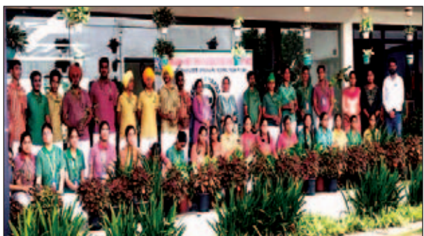
PATRAN, JULY 24

Sparkling Kids The Foundation Senior Secondary School, Patran actively participating in tree planting drive organized by Eco Club for Mission Life, Interact Rotary sponsored club and NSS Unit of the school to educate students on the importance of planting saplings in the name of a tree mother. was given