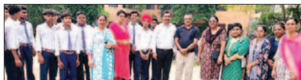
JAGRAON, JULY 24

As per the instructions of Punjab School Education board, several fun-filled activities are being conducted for the students at the premises of RK High School.