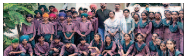
MORINDA, JULY 24

Under the Student-Police Candidate Scheme, Morinda Police took the students of Shaheed Kashi Ram Memorial Government School Madauli Kalan on a tour of police stations and police community centers.