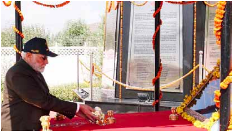
AGENCY KARGIL (LADAKH), JULY 26

NEW DELHI: The CBI has arrested 43 suspected cyber criminals as it busted a call centre in Gurugram which allegedly duped foreigners by offering technical solutions to problems with their computers, officials said Friday. The CBI has arrested 43 suspected cyber criminals as it busted a call centre in Gurugram which allegedly duped foreigners by offering technical solutions to problems with their computers, officials said Friday. The CBI raided the office of Innocent Technology (OPC) Pvt Ltd operating from DLF Cyber City, Gurugram, where the central agency found several agents on live calls aimed to cheat foreigners, they said.