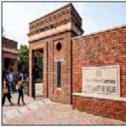
DU cracks down on ragging, new measures like expulsion announced