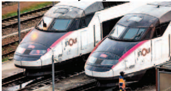
JULY 26