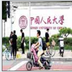
Rising sexual harassment in Chinese campuses