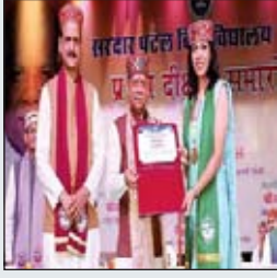
Governor confers degrees at inaugural convocation of Sardar Patel University