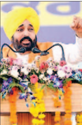
BATHINDA, SEPT 23

Punjab Chief Minister Bhagwant Singh Mann on Monday said that the people who are envious of peace, progress and prosperity of state are spreading baseless canards about him to derail the growth of state. Addressing the gathering after dedicating 30 new Aam Aadmi Clinics to the state here today, the Chief Minister said that he is dedicatedly working for the well being of the state and prosperity of its people. He said that some of the political