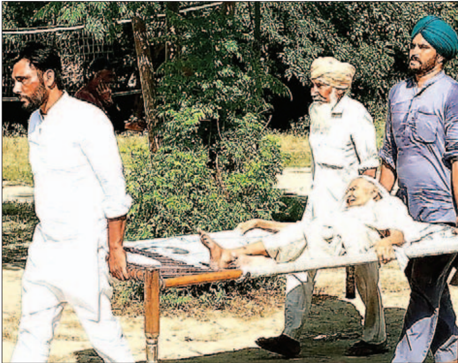
99-years- old woman's relatives taking her to polling station.