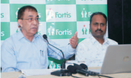
Hospital, Mohali, highlighted this growing issue during a media