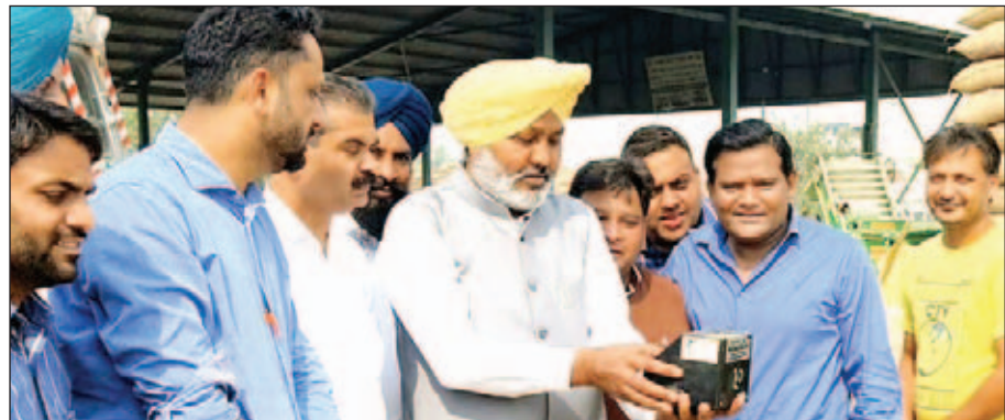
SUMER GARG DIRBA, OCT 27

Punjab Finance Minister (FM), Harpal Singh Cheema today made a surprise inspection of the purchase and the lifting of paddy at local anaj mandi. He instructed the officers of the concerned departments present on the spot to carry out the procurement, lifting and payment to the farmers of their commodities during the entire paddy season as per the time limit set by the Punjab Government.