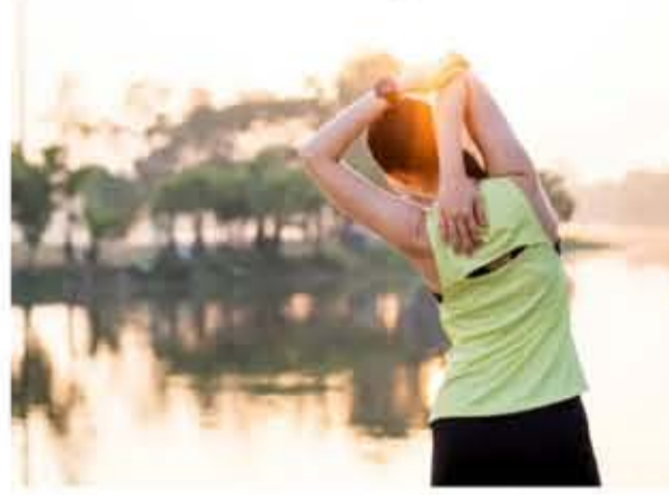
these things yourself from time to time. Walk Short Distances We

Sedentarism is a curse that accompanies modern life. Given the many comforts and conveniences we have at our disposal today, people have little motivation to get their daily dose of physical activity.