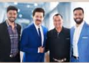
solutions for interiors, Viva's products are known for their cutting-edge technology, including industry-first innovations like 4 color

continues to set the benchmark for high-quality, stylish, and durable cladding solutions. From redefining facades to offering contemporary