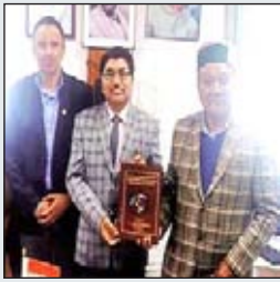
Committee submits report on Pong Dam oustees rehabilitation