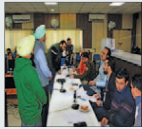
CM's Office reviewing Samadhan camps through VC