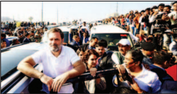
AGENCY NEW DELHI, DEC 4