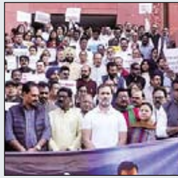
Winter Session 2024: INDIA bloc MPs stage protest for second day in row