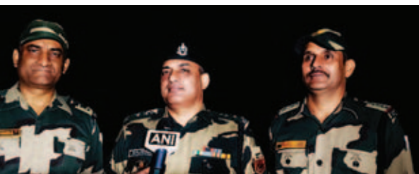
AGENCY AGARTALA, DEC 4

The Chief Minister said that during Congress rule, there was no consideration if a farmer's crop was damaged, and farmers received only 5 to 10 rupees as compensation. However, under our government, farmers are now provided full compensation in the event of crop damage. Sh. Nayab Singh Saini said that under the Pradhan Mantri Krishi Sinchai Yojana, one-and-a-half times more land is being irrigated compared to the area under cultivation before 2014.